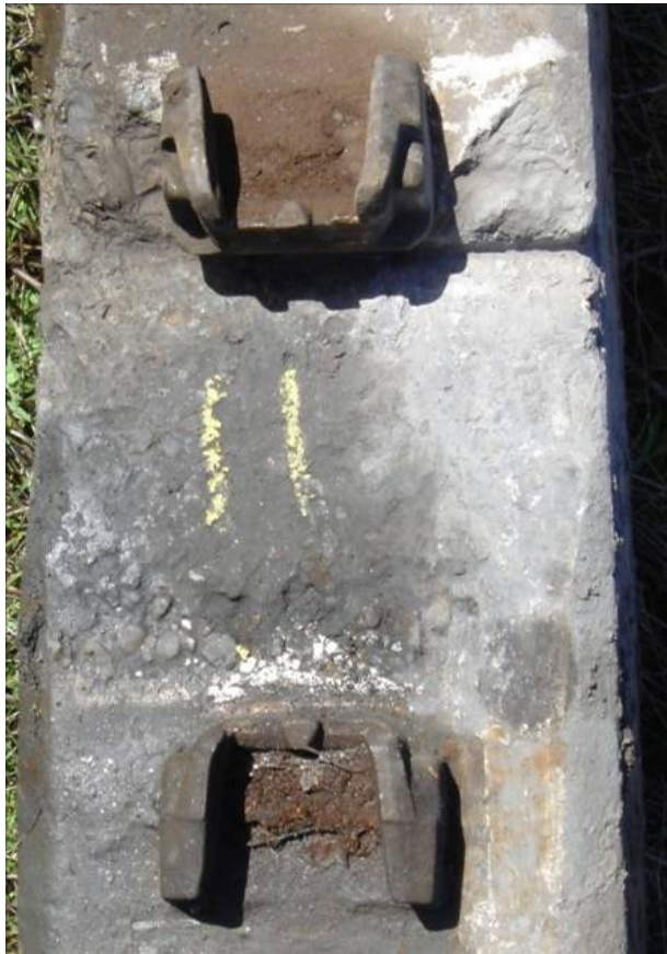
Figure 1: Concrete tie rail seat deterioration (RSD)

failures in the ballast and subgrade layers, but the ties influence these failures by how well they distribute traffic loads.