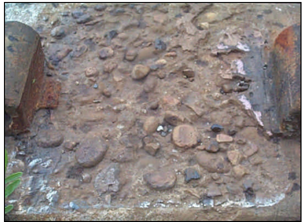
Figure 2: RSD, with horizontal pattern and cement paste wear [9]

There is currently a somewhat standard qualification test for concrete ties in North America that is intended to simulate RSD. In the test, cyclic loads are applied at a lateral-to-vertical (L/V) ratio of 0.52, with water and sand present at the rail seats of a fully assembled tie