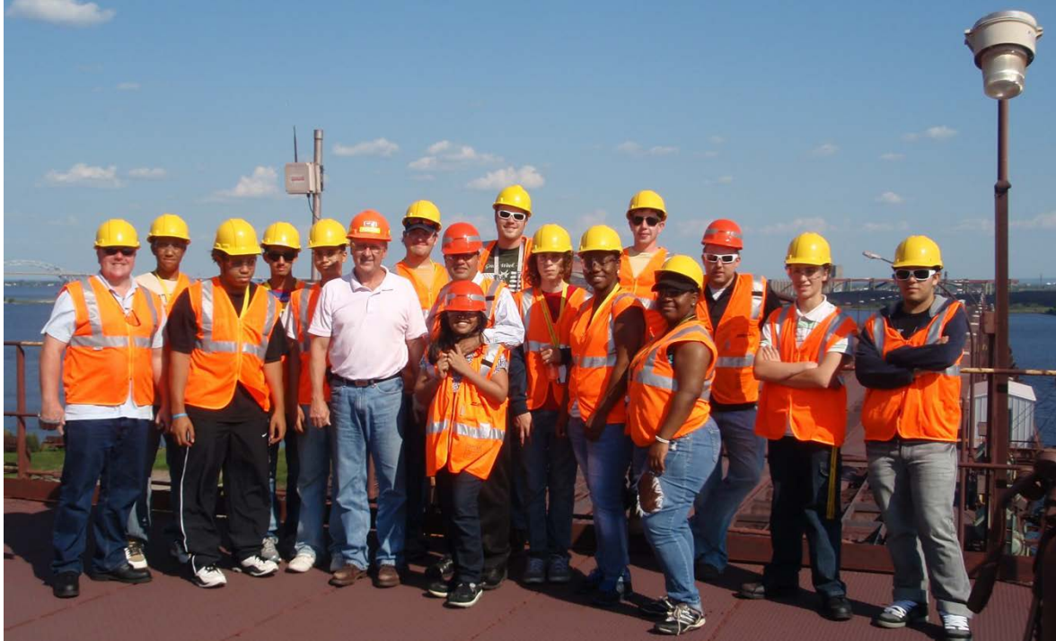
FIGURE 2: Summer Youth Program Participants in Duluth, Minnesota